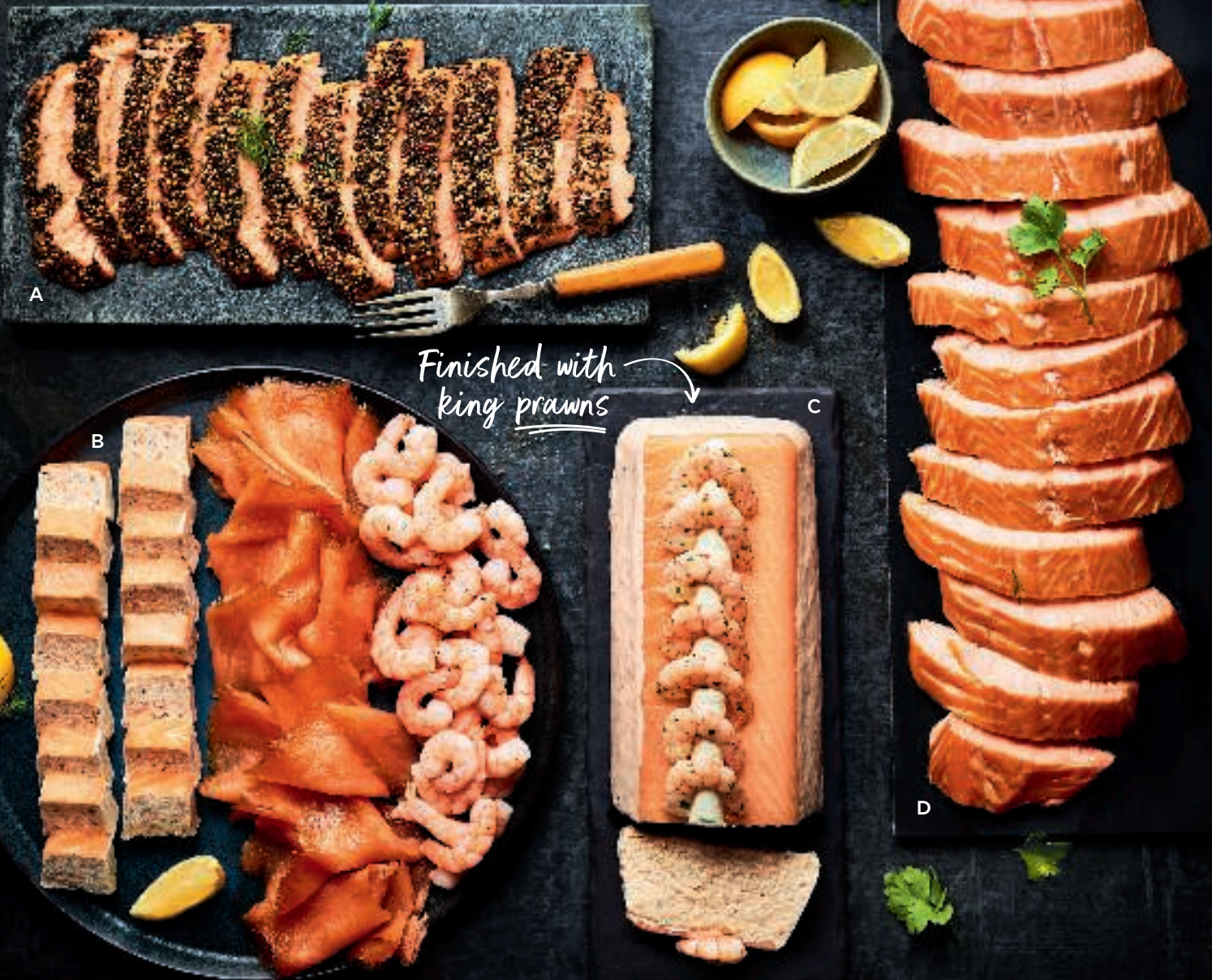
A Arbroath hot-smoked Scottish salmon £15 A side of hot-smoked salmon, dressed with cracked black pepper, mustard seeds and dill. Serves 6 | 300g (£5 per 100g) 00474115

Our ready-to-serve starters make it easy to kick off celebrations in style